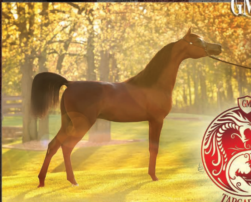
Stuart Vesty Photo