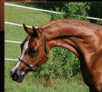
Clockwise from left: Foundation Broodmares; Klassic, Silver And Sable, Padrons Nike