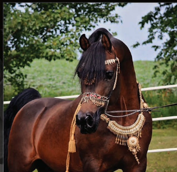
Multi-National Champion First Cyte, Greymoor Foundation Sire