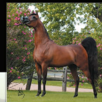
First Cyte daughters and second generation broodmares Drama Qyeen and Harleqyin

"Time has allowed me to take a good look at what the second generation of my breeding program (my First Cyte daughters) are producing and my program is proving to be everything I had hoped it would be. Those daughters represent the First Cyte "look" and are marrying that look beautifully with carefully selected stallions. I can't wait for the next round of foals!"